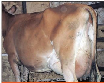
Westport dau. / Fr. July / 96 lbs. @ 161 days fresh. Pkd. over 100 lbs. 6.5 BF