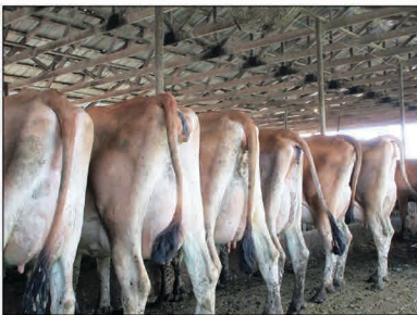
1st Lactation Cows