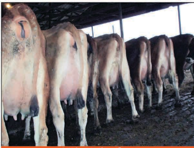
1st Lactation Cows

20+ Confirmed A2-A2 many more Being tested