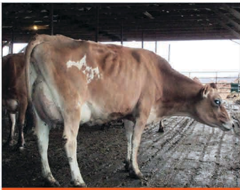
Westport dau. / Fr. Dec. From high component family.

Directions: From Pine Grove follow Rt. 443 East 5 mi. Turn left onto Meadow View Rd. Follow 1/2 mi. to farm on right OR from I-78 take Exit 19 for Rt. 183 North. Follow Rt. 183 North 10 miles. Turn left onto Rt. 443 Follow for 5 mi. Turn right onto Meadow View Rd. Go 1/2 mi. to Farm on right.